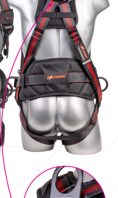
Dorsal D-ring Plus™ Fast, easy, and safe installation of dual SRL connector.