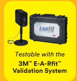
Testable with the 3M™ E-A-Rfit™ Validation System